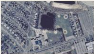
Aerial photograph of development on Long Island showing recharge basin.

Ground water is the sole source of freshwater for the more than 3 million people who live on Long Island outside the metropolitan New York City boundary. (The Long Island ground-water system was discussed earlier in the sections on "Ground-Water Development, Sustainability, and Water Budgets" and "Effects of Ground-Water Development on Ground-Water Storage.") To help replenish the aquifer, as well as reduce urban flooding and control saltwater intrusion, more than 3,000 recharge basins dispose of storm runoff at an average rate of about 150 million gallons per day. Initially, many of these basins were abandoned gravel pits, but since 1936 urban developers are required to provide recharge basins with new developments. Practically all basins are unlined excavations in the upper glacial deposits and have areas from less than 0.1 to more than 30 acres.